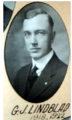
C.B. & Q. Railroad Freight Solicitor, and Clerk

He died September 5, 1959 in Naperville, DuPage County, Illinois and interment was made in the Naperville Cemetery.